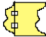
tape to opposite side