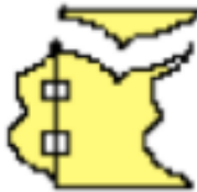
cut second plain side