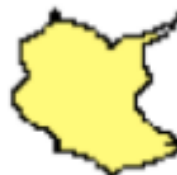
A tessellating shape is formed