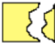
cut one side