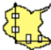
tape to opposite side